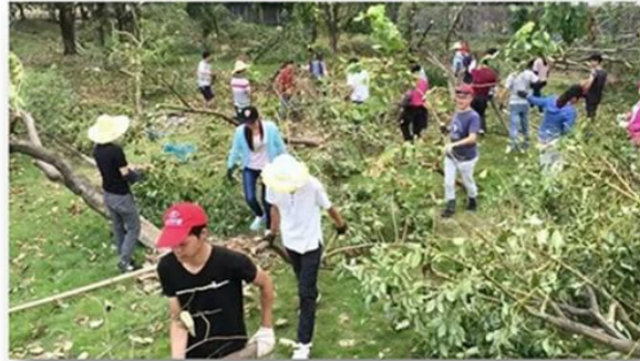
Voluntary tree planting after Super Typhoon Meranti in 2016