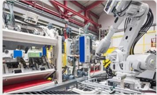
Robot spray mould release agent and injection PU raw material