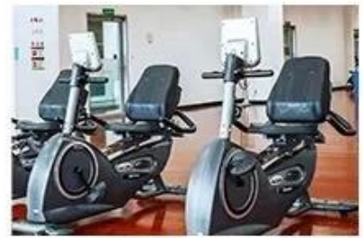
Sport Fitness Equipment ...