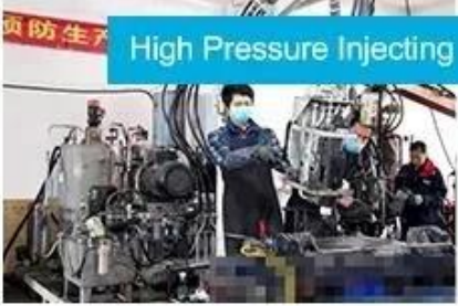
High Pressure Injecting