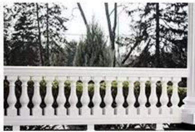
Building Material ...