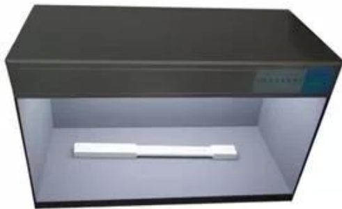
Standard Color compare Lighter box