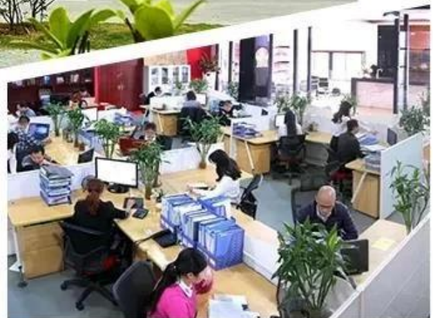
R & D Department