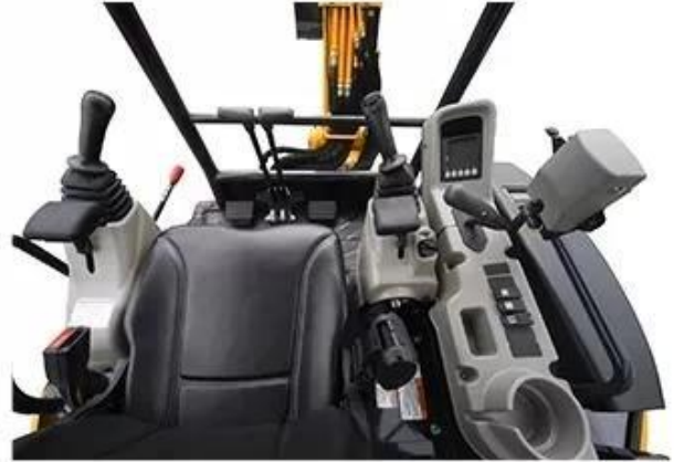
Engineering Machine ...