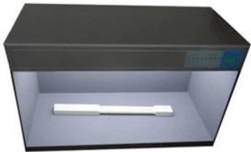
Standard Color compare Lighter box