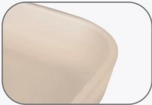
Fillet treatment Do not cut hands