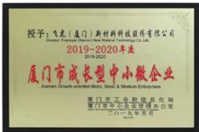
Xiamen Growth-oriented Micro, Small & Medium Enterprises