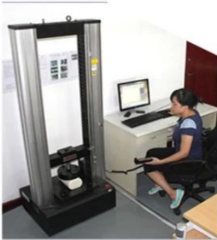
UNIVERSAL TESTING MACHINE(UTM)