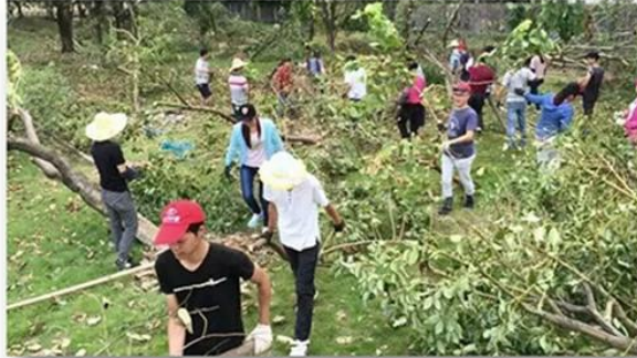
Voluntary tree planting after Super Typhoon Meranti in 2016