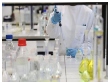
2002 PU Finehope