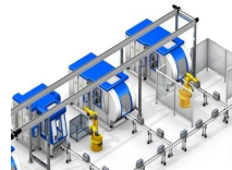
500 PU Finehope