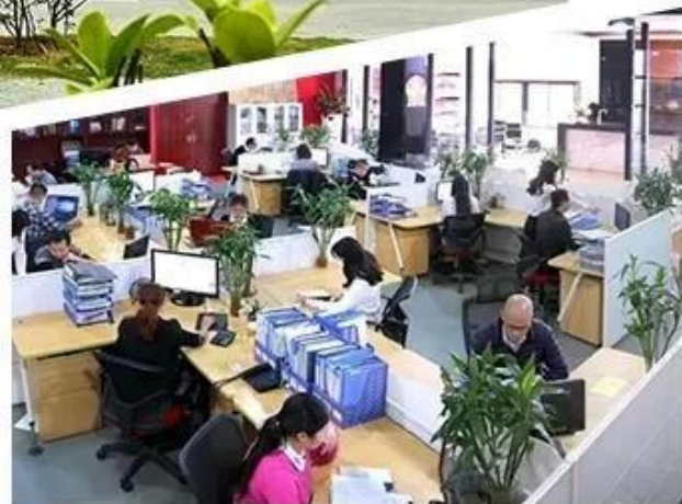
R & D Department