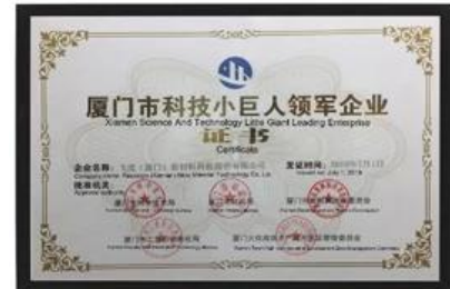
Syarikat Peneraju Sains dan Teknologi Little Giant Xiamen