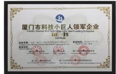
Xiamen Perusahaan Mikro, Kecil & Sederhana yang berorientasikan Pertumbuhan