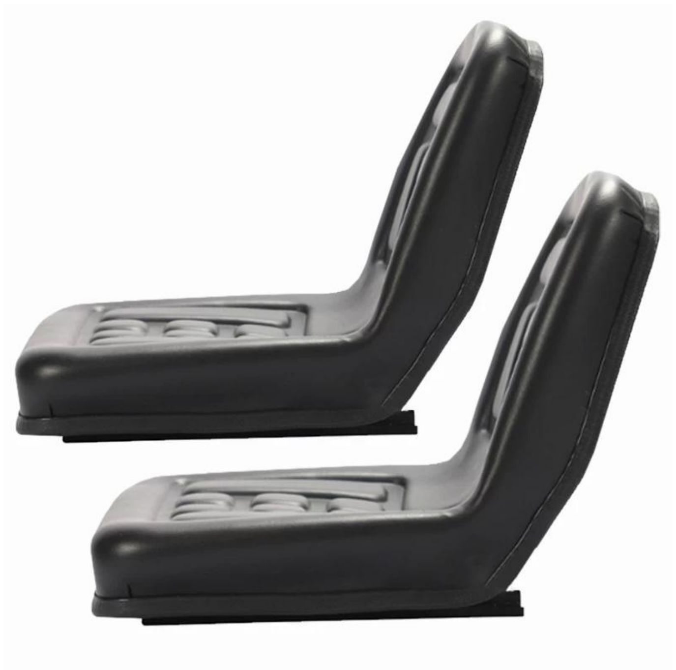
Sesuaikan kerusi pemotong rumput kalis air pu poliuretana