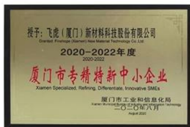
Xiamen Khusus, Menapis, Membezakan, PKS Inovatif