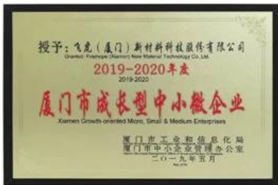
Xiamen Perusahaan Mikro, Kecil & Sederhana yang berorientasikan Pertumbuhan