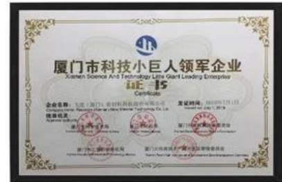
Syarikat Peneraju Sains dan Teknologi Little Giant Xiamen