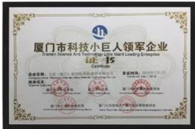
Xiamen Perusahaan Mikro, Kecil & Sederhana yang berorientasikan Pertumbuhan