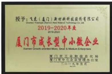
Xiamen Perusahaan Mikro, Kecil & Sederhana yang berorientasikan Pertumbuhan