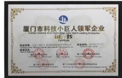
Syarikat Peneraju Sains dan Teknologi Little Giant Xiamen