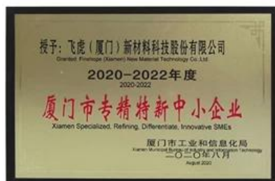
Xiamen Khusus, Menapis, Membezakan, PKS Inovatif