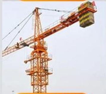
Tower crane construction equipment