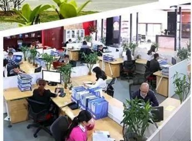
R & D Department