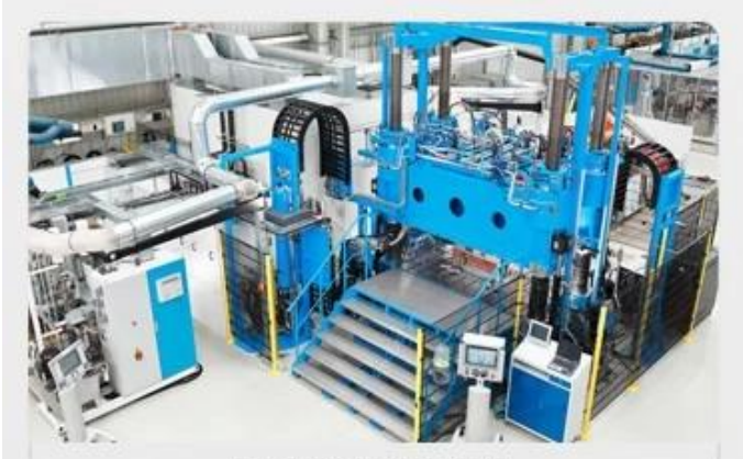
KRAUSS MAFFEI High Pressure Reaction Injection Molding (RIM) Machine from Germany