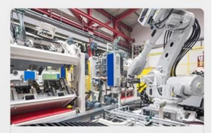
Robot spray mould release agent and injection PU raw material