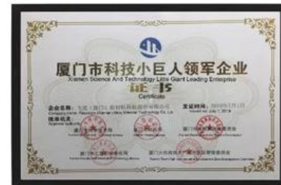
Xiamen Science and Technology Little Giant Leading Enterprise