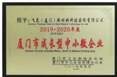
Xiamen Growth-oriented Micro, Small & Medium Enterprises