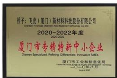
Xiamen Specialized, Refining, Differentiate, Innovative SMEs