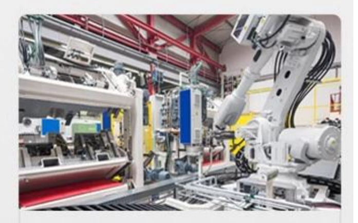
Robot spray mould release agent and injection PU raw material