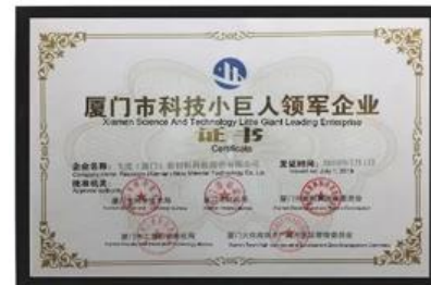
Xiamen Science and Technology Little Giant Leading Enterprise