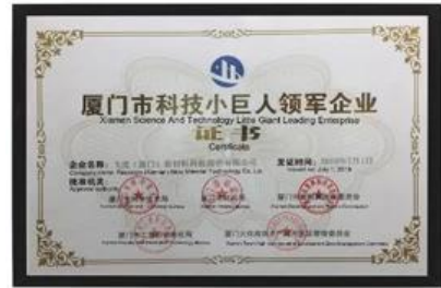
Xiamen Science and Technology Little Giant Leading Enterprise