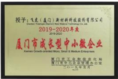
Xiamen Growth-oriented Micro, Small & Medium Enterprises