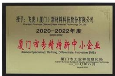
Xiamen Specialized, Refining, Differentiate, Innovative SMEs