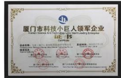
Xiamen Science and Technology Little Giant Leading Enterprise