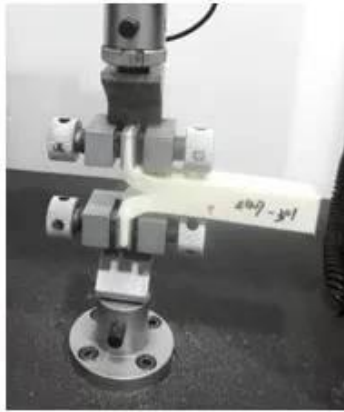
Tear Resistance Test