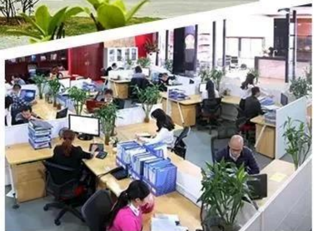
R & D Department