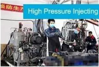
High Pressure Injecting