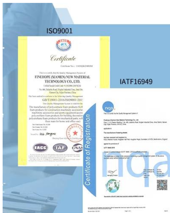
Finehope 2003 聚氨酯 ISO 9001