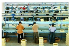
R & D Department