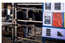
QC / Acceptance Standard