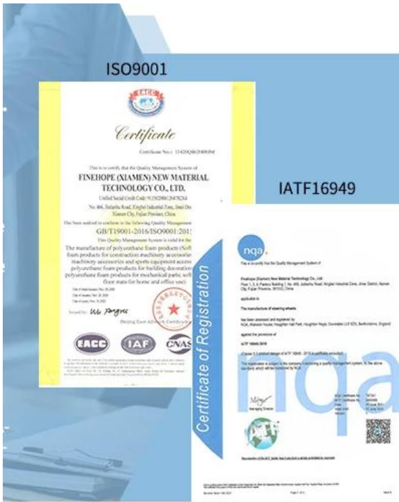
Finehope 2003 ISO 9001

IATF16949 pu Finehope 2021 IATF16949 50 2007 Finehope Caterpillar Finehope SPC MSA FMEA APQP PPAP